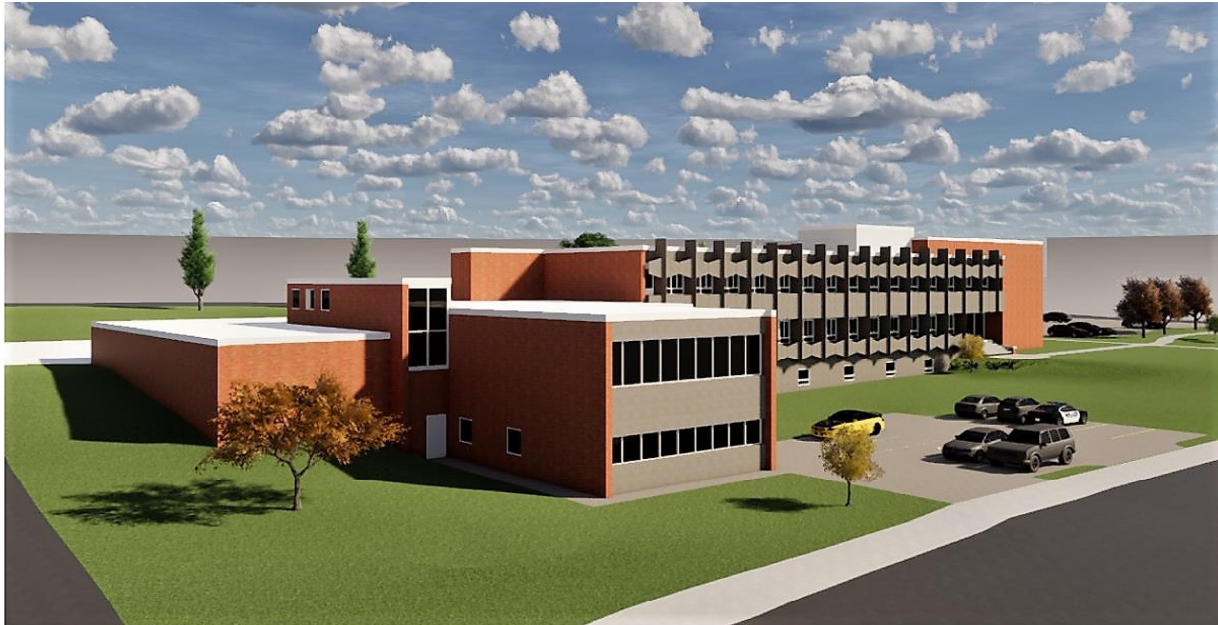
Concept – Rendering 2