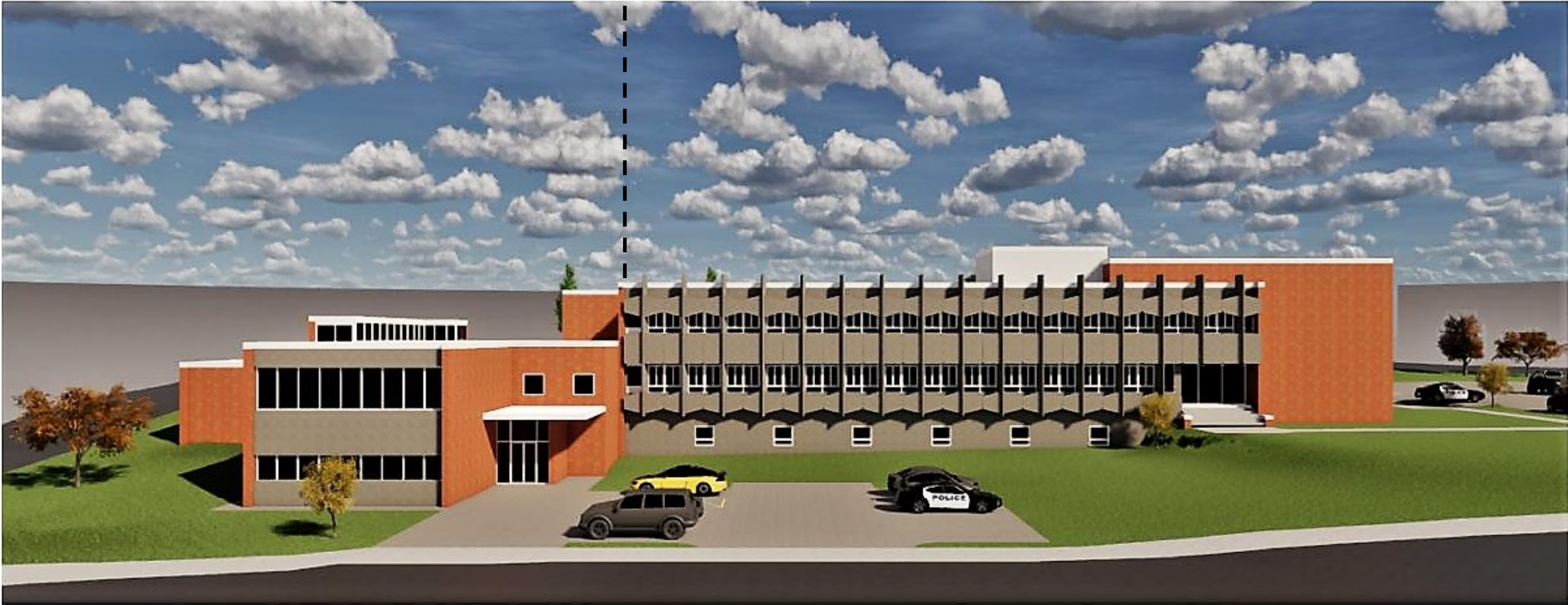
Concept – Front Elevation