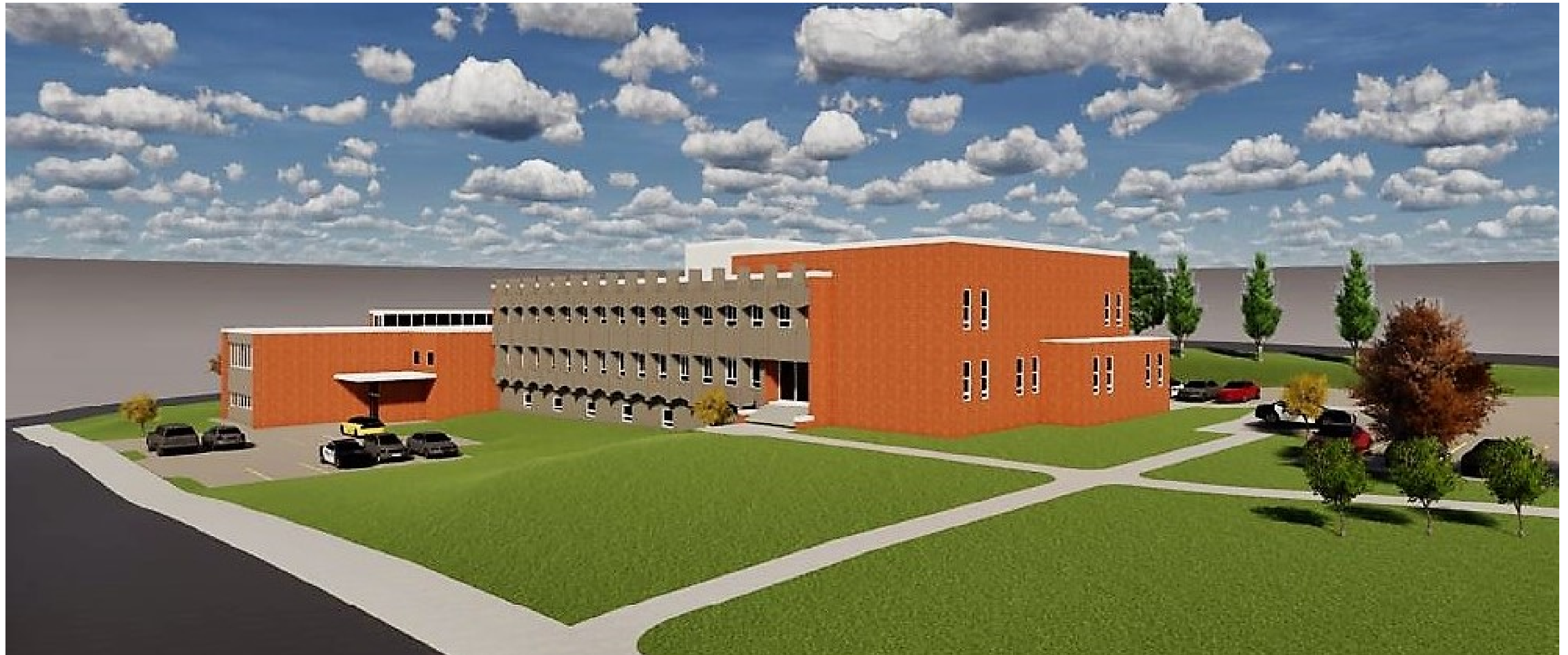
Concept – Rendering 1