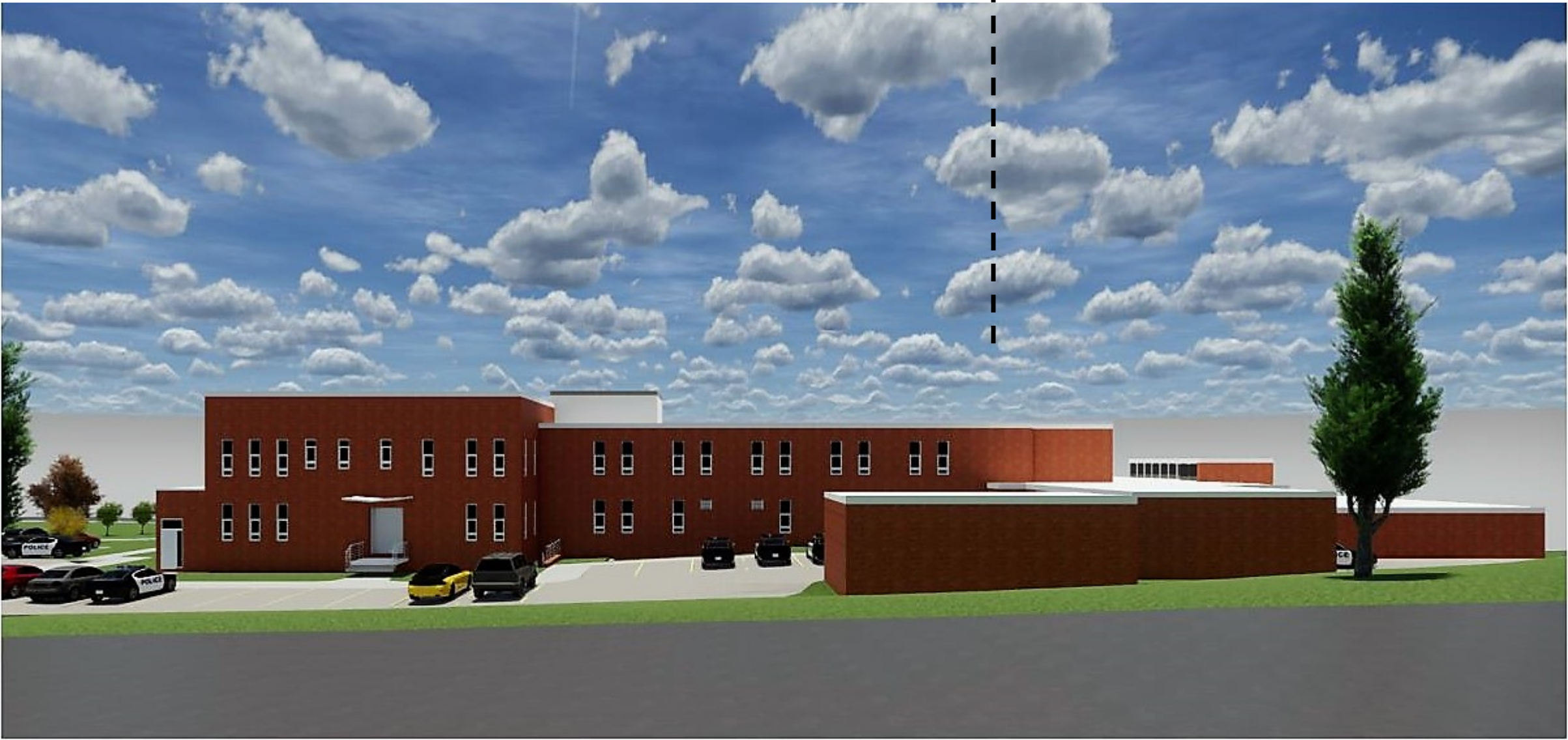
Concept – Back Elevation – Rendering 3

Existing Courthouse ————●———●———— New Law Enforcement Addition