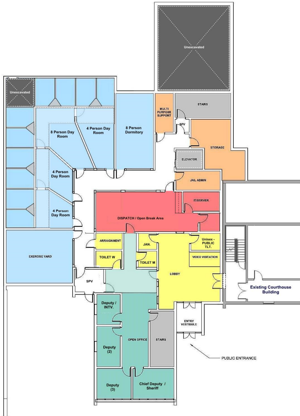
Concept Ground Floor – Lower Level Plan